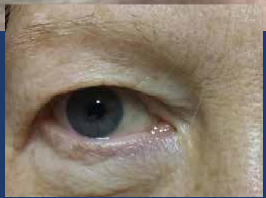
BEFORE THE OPERATION